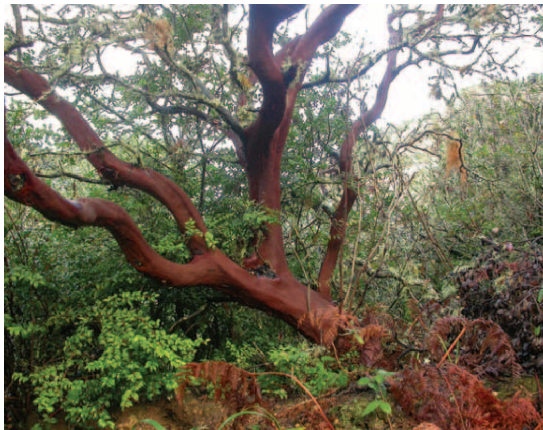
A very old specimen of Montara manzanita ( Arctostaphylos montaraensis ) growing on Montara Mountain in San Mateo County with huckleberry ( Vaccinium ovatum ) and bracken fern ( Pteridium aquilinum var. pubescens ).

At this point, the diversity of Ceanothus and Arctostaphylos and their central role in California chaparral lies in how their life histories interact with California's multiple topographic, edaphic, and climate gradients. Their dormant seed banks and wildfire create conditions for rapid change. Glacial epochs, migrations, and hybridization have kept the process of adaptation and speciation ongoing. Recent research using molecular genetic techniques indicates that for both Arctostaphylos and Ceanothus there are two old and distinct lineages. However, when it comes to the current species, the genetic levels explored so far indicate little differentiation exists. Future work will eventually tease out these patterns of history and give us a richer understanding of the extent and multitude of evolutionary pathways that these plants have wandered.