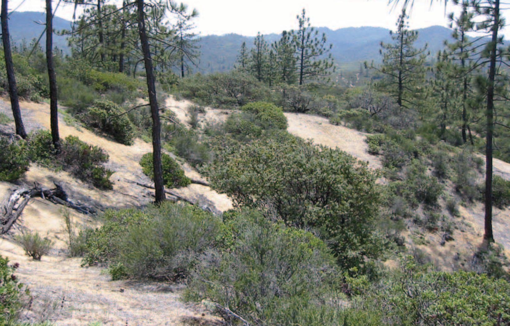
The rare and newly described Gabilan manzanita ( Arctostaphylos gabilanensis ) in its habitat at the headwaters of Pescadero Creek in the Gabilan Mountains of Monterey County.