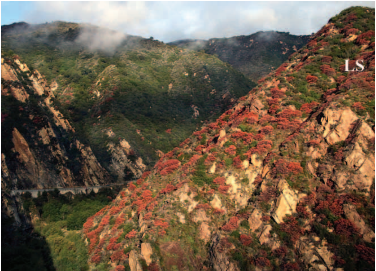
Zonation of chaparral, in response to freezing, along Malibu Canyon Road from the ocean near Malibu to inland Tapia Park. Shrubs with bright red leaves are laurel sumac (LS, Malosma laurina ), which our data have shown undergo leaf death at -6^{\circ}\text{C} and nearly 100% embolism of their stem xylem (Pratt et al. 2005; Davis et al. 2005; Davis et al. 2007). There are less red leaves high on the slopes in the background, which suggests temperatures were above -6^{\circ}\text{C} on higher slopes.