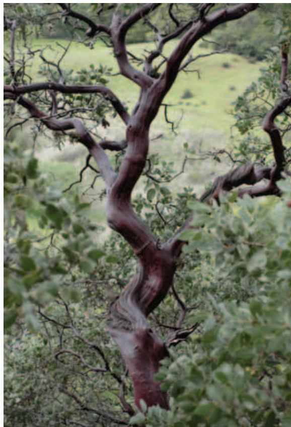
The characteristic rich red-brown smooth bark on the twisted branches of the common manzanita ( Arctostaphylos manzanita ) in a Sonoma County woodland edge.

One group of species has burls or root crowns with dormant buds that permit resprouting of the plants after wildfire. These individuals usually survive a large number of fires, and indeed, unless shaded out by larger plants, may persist indefinitely.