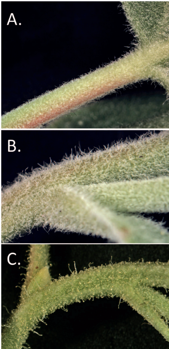
FIG. 3. Differences of stem and rachis pubescence of Arctostaphylos patula subspecies. A) A. patula subsp. gankinii illustrating short canescent hair on leaves, petiole and stem; B) close-up of rachis and bracts on A. patula subsp. gankinii ; C) A. patula subsp. patula rachis and bracts showing the short golden glandular hairs characteristic of the species.

chaparral stands along Tamarack Trail above Upper Sardine Lake near the type locality (39°37'10"N, 120°37'35"W; 1900 m). In eight random samples, the non-glandular morph ranged from 22% to 78% of the stand. Overall, 58% of all 397 individuals sampled in this population were non-glandular.